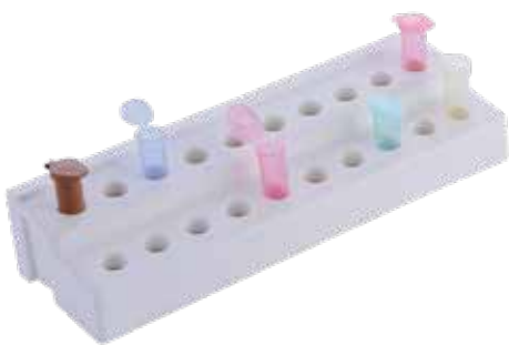
Rack for Micro Centrifuge Tubes