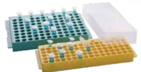
Reversible rack with cover