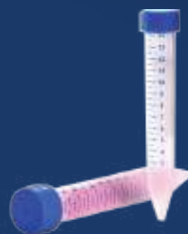
Centrifuge Tube 15 ml (Conical bottom)