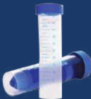
Centrifuge Tube 50 ml (Self stand)